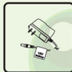
12V AC Charger