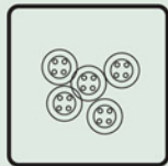
Extra Buttons (Option)