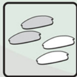
Two extra pairs of Lens Light Blue & Clear (Option)