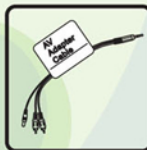
AV Adapter Cable