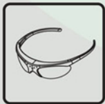
Sunglass Camera (option)

Image Sensor:1/4"CMOS Minimum Illumination:3Lux/0.2Lux Horizontal Resolution:380 TVL Power Supply:5V Dimension:28mmX 20mmX 25mm