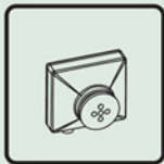
Button Camera (Option)