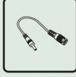
5.5mm to 3.5mm Jack converter